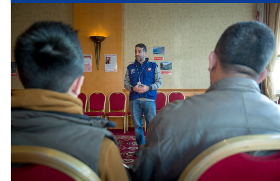
Pre-departure orientation session