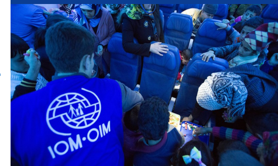
Movement management