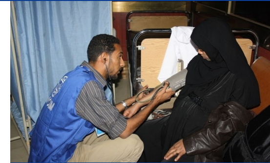
Health assessment